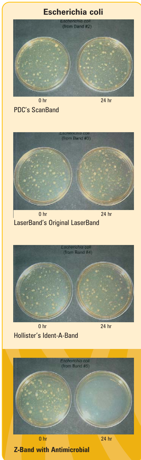
Figure 2. Escherichia coli at 0 HR and at 24 HR