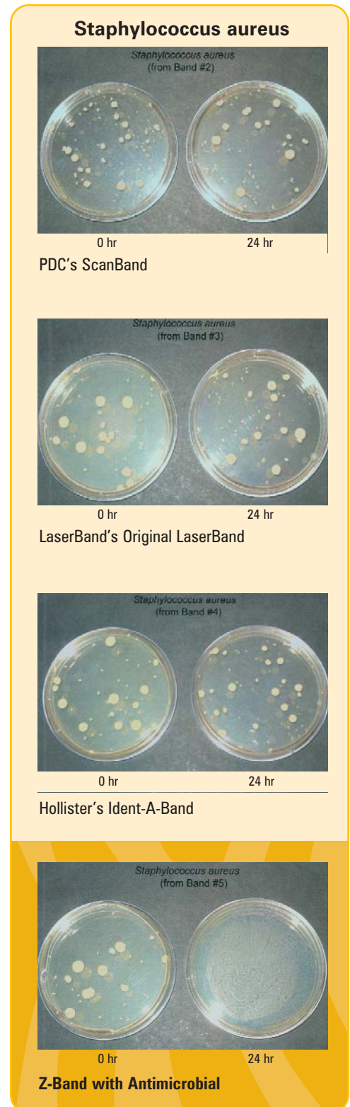
Figure 1. Staphylococcus aureus at 0 HR and at 24 HR.

All four of the wristband test articles were individually inoculated with Staphylococcus aureus , Escherichia coli and Pseudomonas aeruginosa . The 0hr wristband test articles for each microorganism were serially diluted and plated out right away to determine initial bacterial concentration levels. The 24hr wristband test articles for each microorganism were incubated under high-humidity conditions for 24 hours and plated thereafter to determine the bacterial concentration levels after 24 hours. As shown in the pictures of the samples, none of the three microorganisms tested were able to grow or survive on the Zebra Z-Band wristband during the 24-hour test period. See Figures 1-3. The activity of the microorganisms is represented graphically in Figure 4.